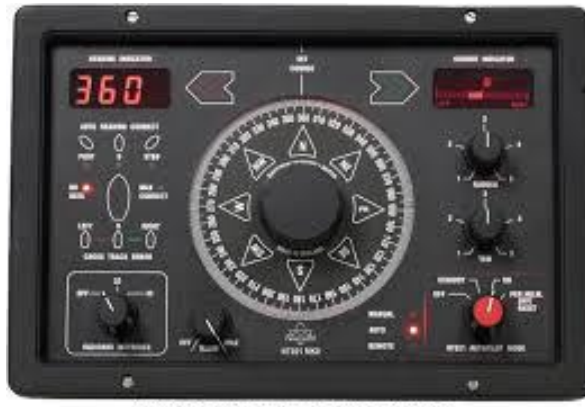
Navitron Autopilot Type NT921MKII